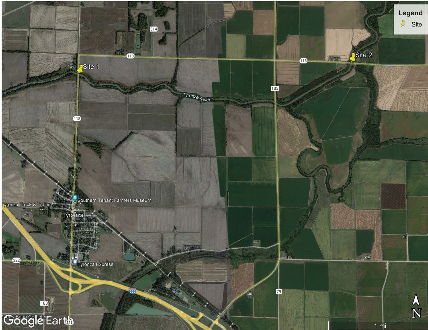
Figure 1. Section 408 Permission Evaluation for Arkansas Department of Transportation, Highway 118 the Tyronza River Bridge Replacements, Poinsett County, Arkansas.